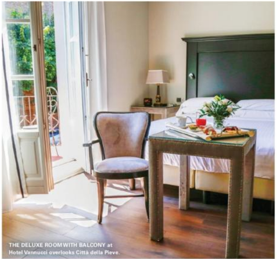
THE DELUXE ROOM WITH BALCONY at Hotel Vannucci overlooks Città della Pieve.