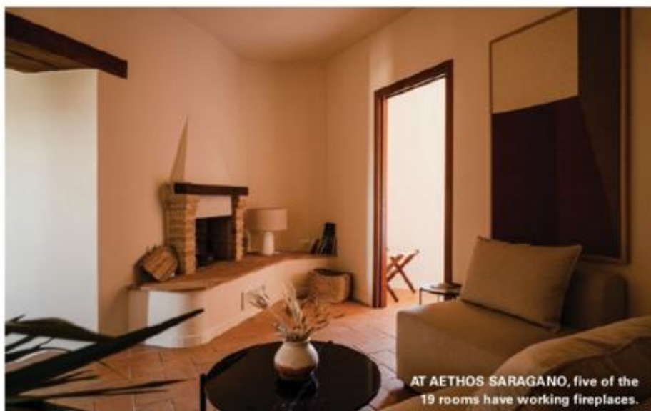
AT AETHOS SARAGANO, five of the 19 rooms have working fireplaces.

The aim here is sustainability and five of the 19 rooms have working fireplaces. The property is compact, reflecting the fact that it's part of a village where the narrow, cobbled streets are for walking only. The pool is below the level of the property, which gives bathers an unobstructed view of the olive orchards and vineyards that surround them. One whole side of Aethos Saragano is devoted to terraces looking out across the countryside, including that of Ceci, the restaurant. (Tip: Try Delfina Vincenti's delicious baked fior dell zucca). The interior of the village encloses a tiny piazza