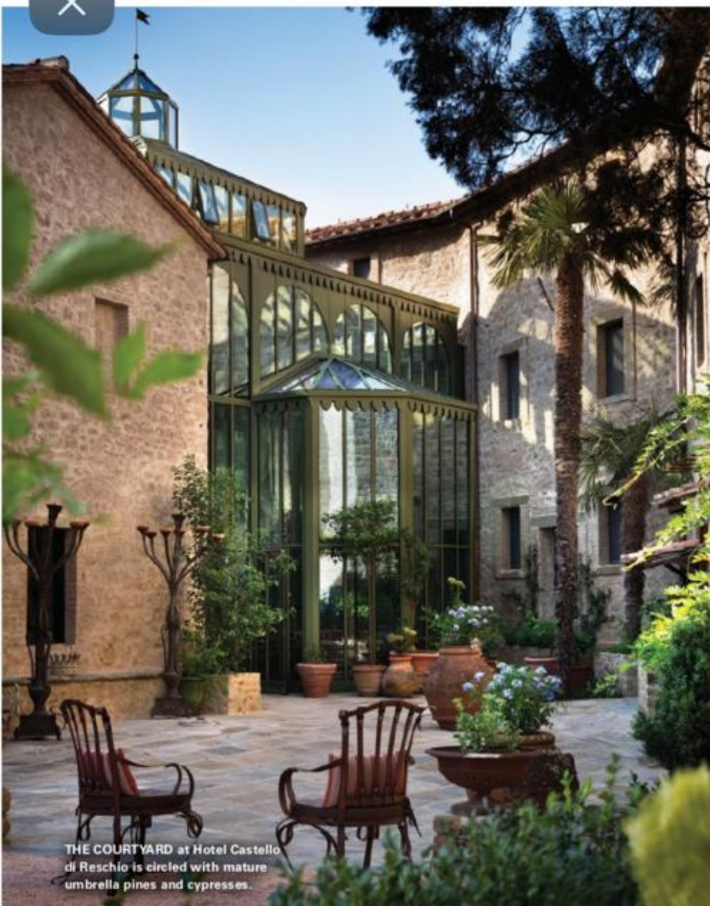
THE COURTYARD at Hotel Castello di Reschio is circled with mature umbrella pines and cypresses.