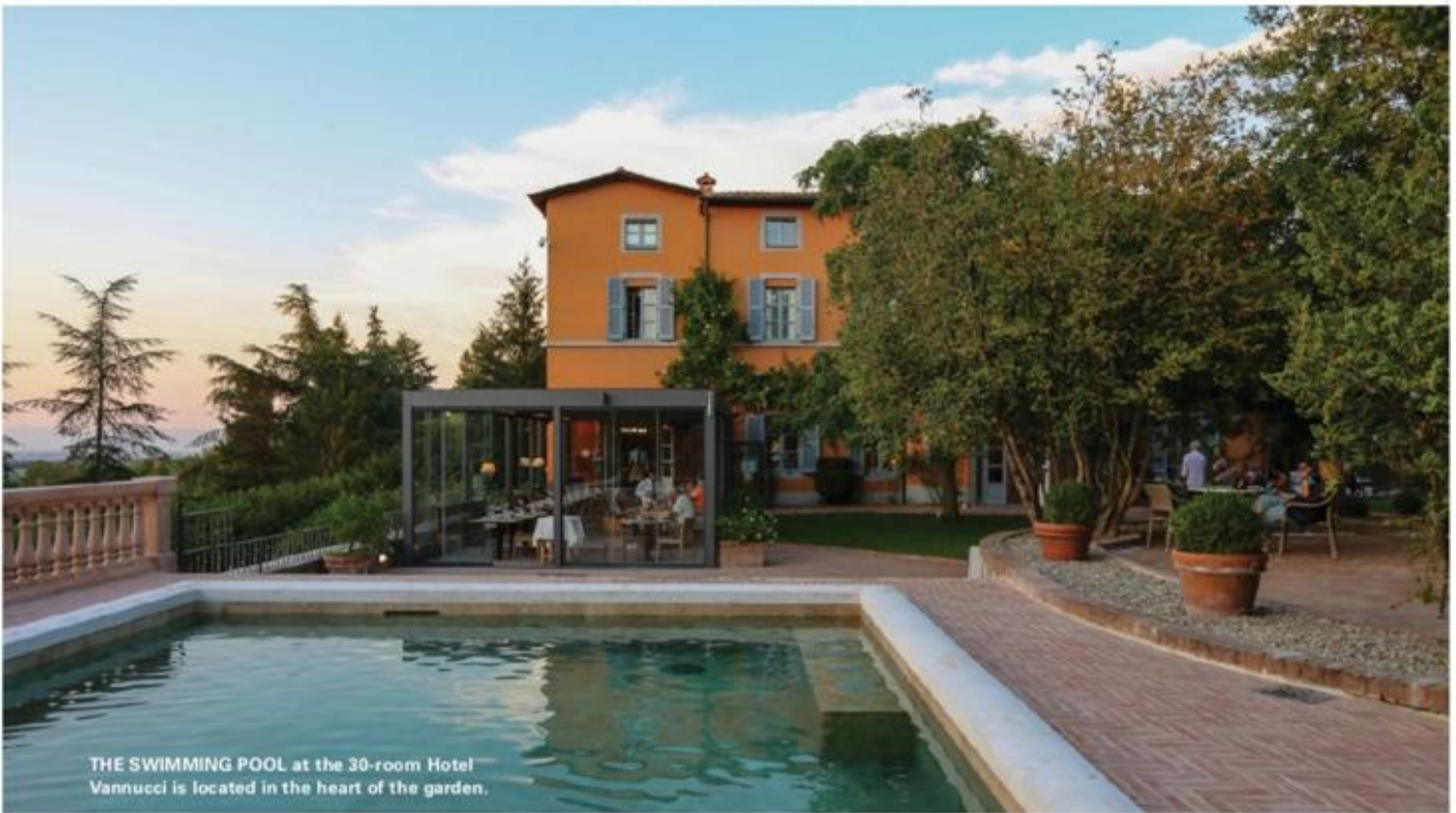
THE SWIMMING POOL at the 30-room Hotel Vannucci is located in the heart of the garden.